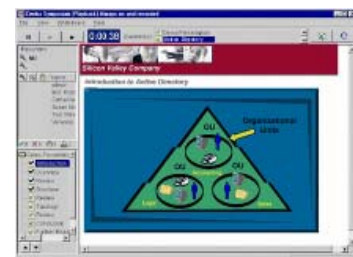
Live mentoring through application sharing and collaboration