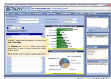
Learning-by-doing through software simulations and workflows